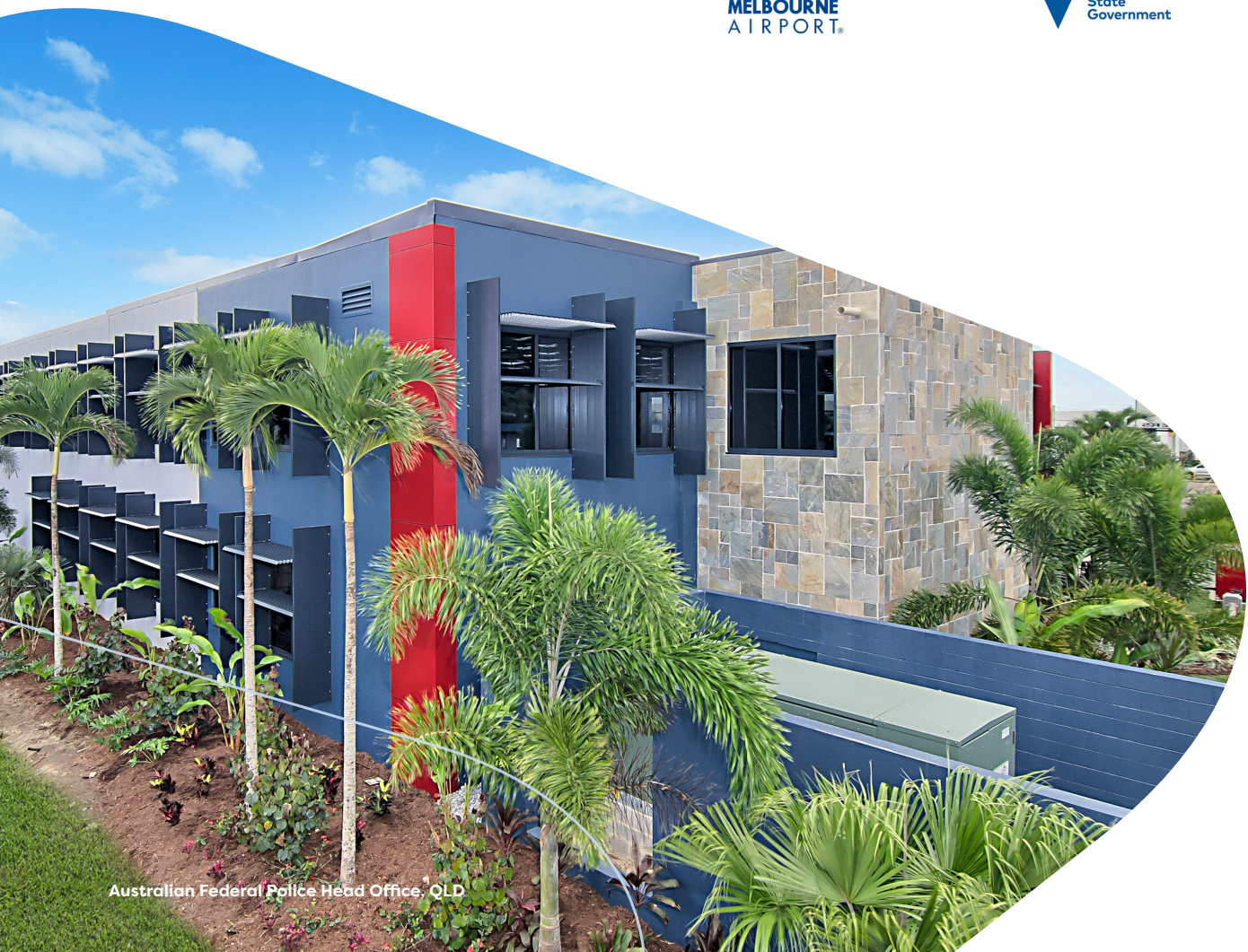
Australian Federal Police Head Office, QLD