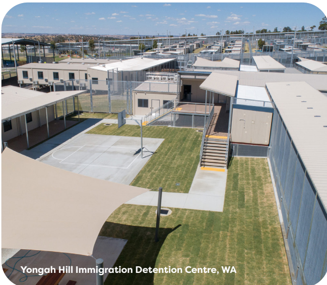
Yongah Hill Immigration Detention Centre, WA

years working for the Federal Government