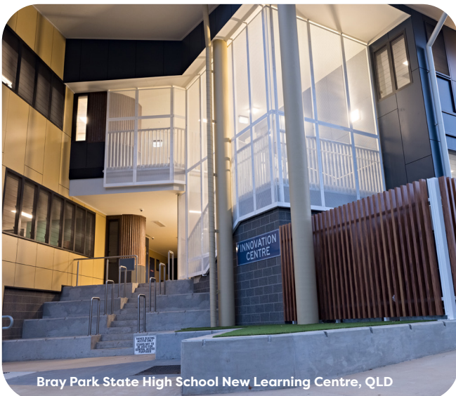
Bray Park State High School New Learning Centre, QLD

Primary and secondary schools in the public, private and independent sectors complement our extensive tertiary portfolio of TAFE's and universities across Australia. Pre-qualified with all State and Territory Governments, ADCO continues to deliver Australia's most advanced learning facilities.