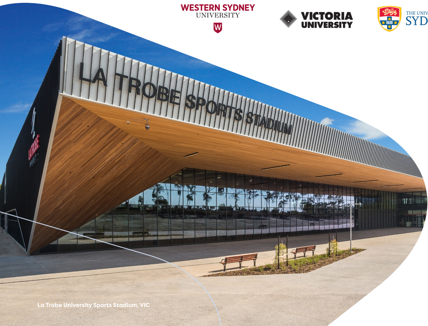
La Trobe University Sports Stadium, VIC