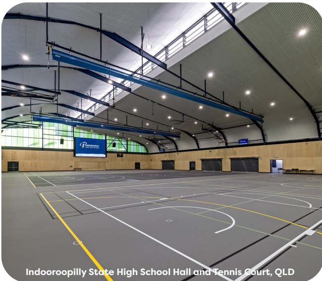
Indooroopilly State High School Hall and Tennis Court, QLD

For over 50 years ADCO has been entrusted to deliver the educational facilities that teach our nation.