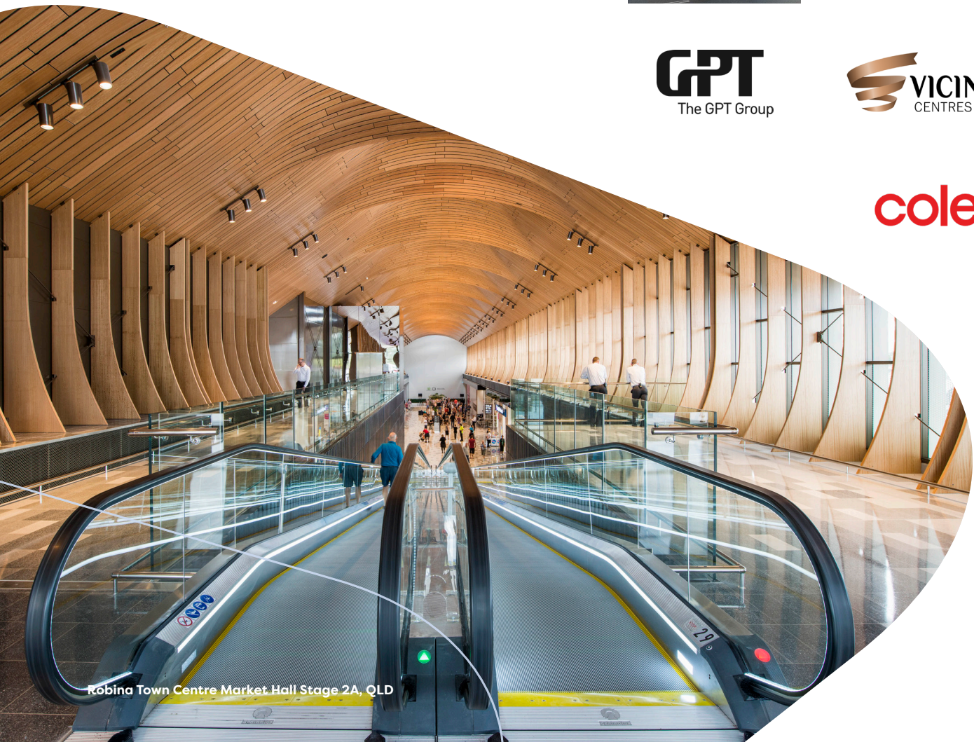
Robina Town Centre Market Hall Stage 2A, QLD