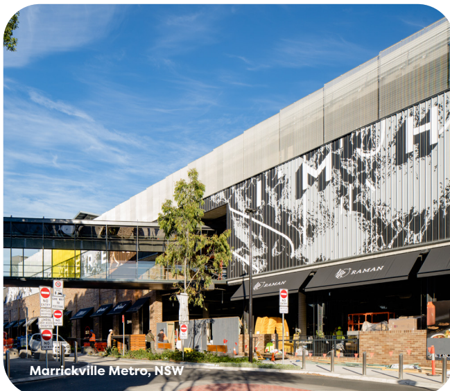
Marrickville Metro, NSW

It runs deep in our DNA and remains one of our largest markets. Greenfield developments, major extensions and detailed refurbishments continue to illustrate our ongoing contribution to Australia's evolving retail landscape. We deliver projects for the REIT sector, direct retailers, and key private clients.