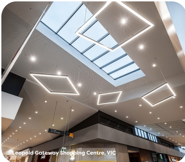
Leopold Gateway Shopping Centre, VIC

Our portfolio spans large format retail centres, conventional, food and beverage, specialty retail, entertainment precincts, cinema complexes and high-end fashion developments.