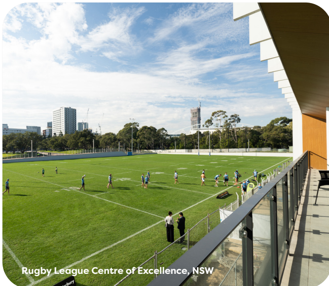
Rugby League Centre of Excellence, NSW

Our portfolio includes an array of government-owned developments encompassing cultural, performing arts and entertainment precincts.