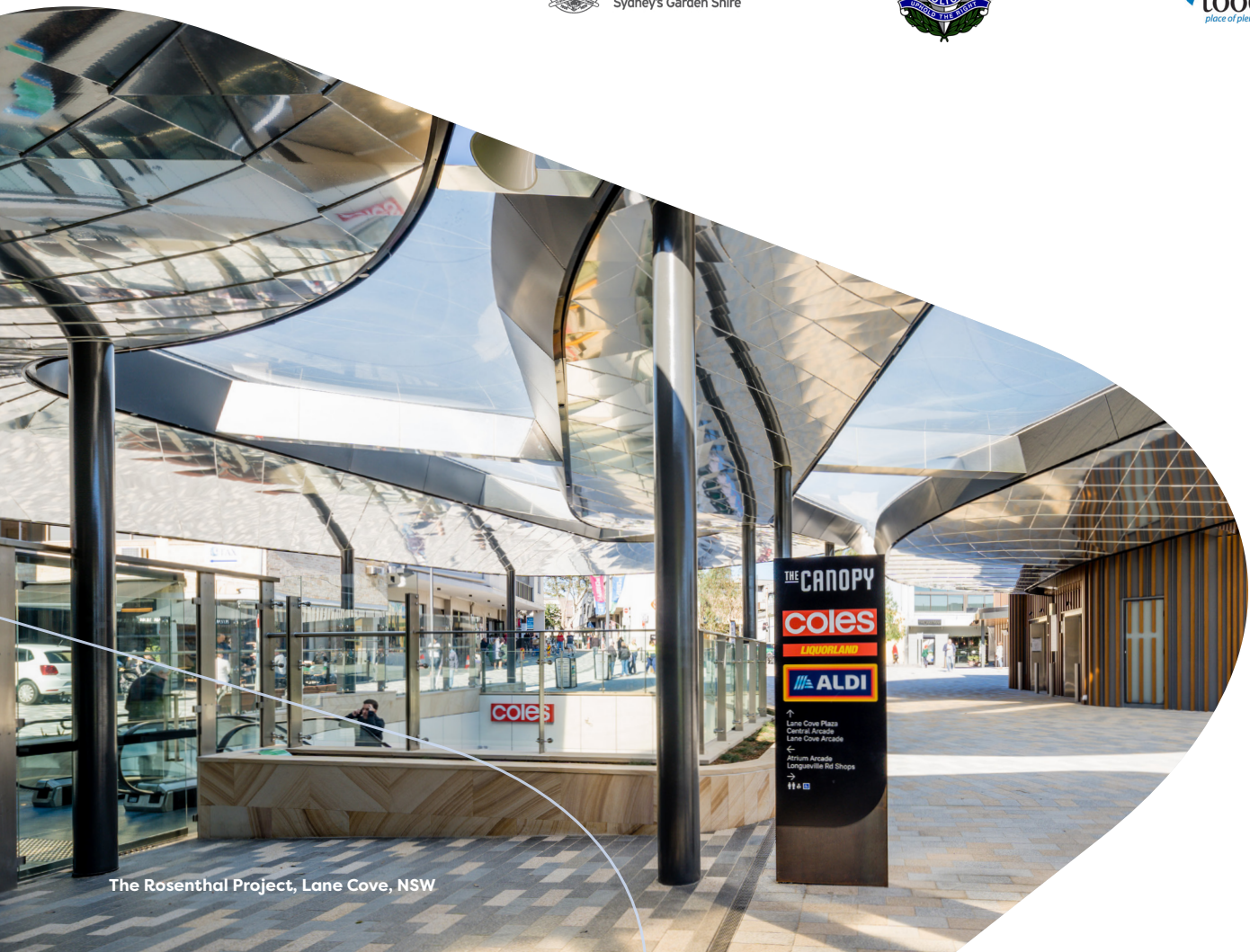
The Rosenthal Project, Lane Cove, NSW