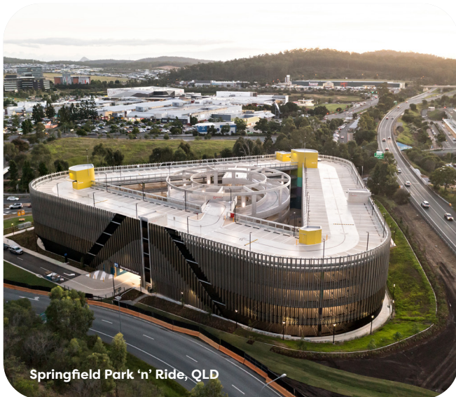
Springfield Park 'n' Ride, QLD

ADCO brings extensive experience across freight logistics, cross dock distribution and parcel sorting centres.