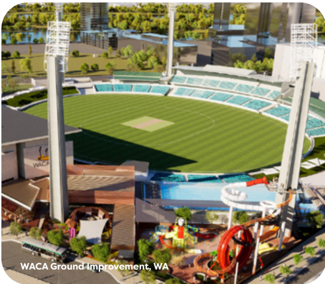
WACA Ground Improvement, WA

Our portfolio includes an array of government-owned developments encompassing cultural, performing arts and entertainment precincts.