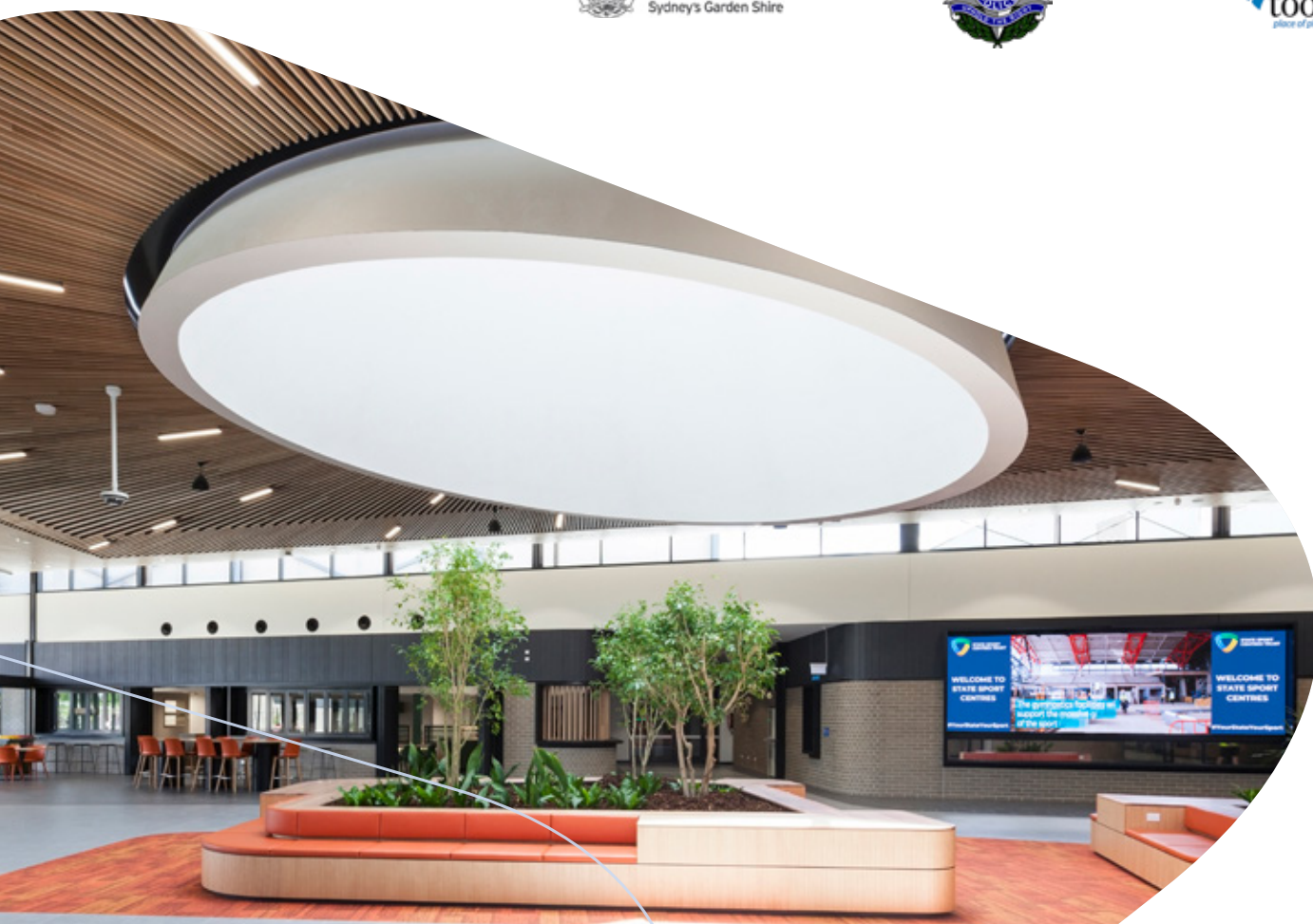
State Basketball Centre, VIC