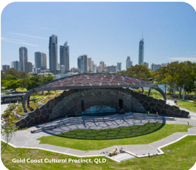
Gold Coast Cultural Precinct, QLD

For many decades we have been entrusted to deliver key social infrastructure projects that bring Australians together to perform, exercise, play and be entertained. As a fully accredited contractor for all Australian states and territories, as well as the Federal Government, ADCO delivers the facilities that shape our nation's communities.