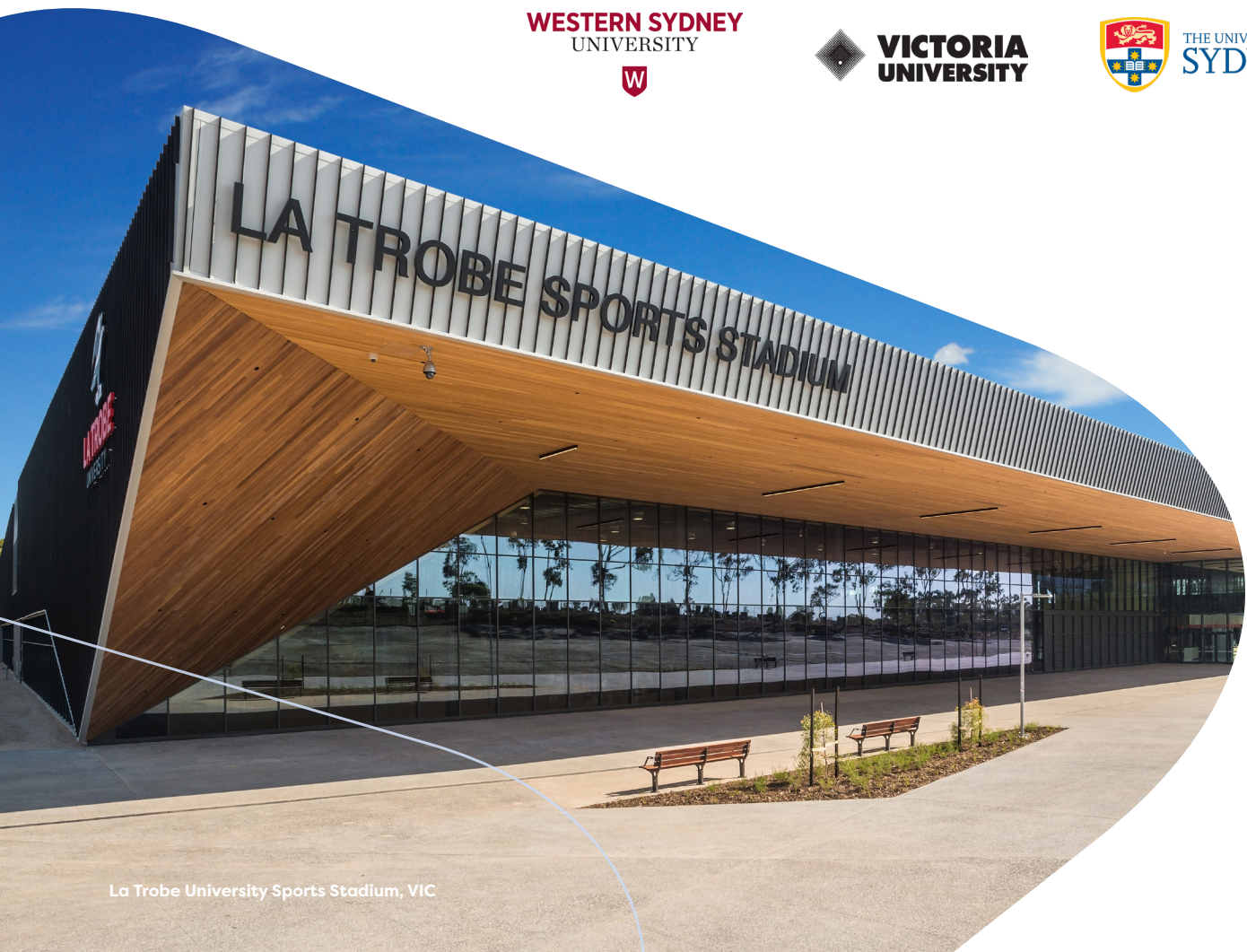
La Trobe University Sports Stadium, VIC