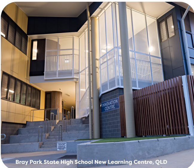
Bray Park State High School New Learning Centre, QLD

Primary and secondary schools in the public, private and independent sectors complement our extensive tertiary portfolio of TAFE's and universities across Australia. Pre-qualified with all State and Territory Governments, ADCO continues to deliver Australia's most advanced learning facilities.