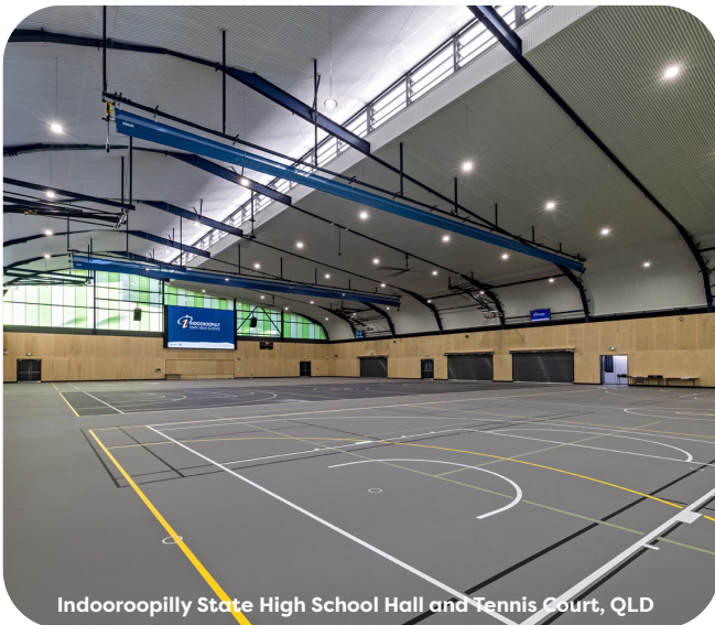
Indooroopilly State High School Hall and Tennis Court, QLD

For over 50 years ADCO has been entrusted to deliver the educational facilities that teach our nation.